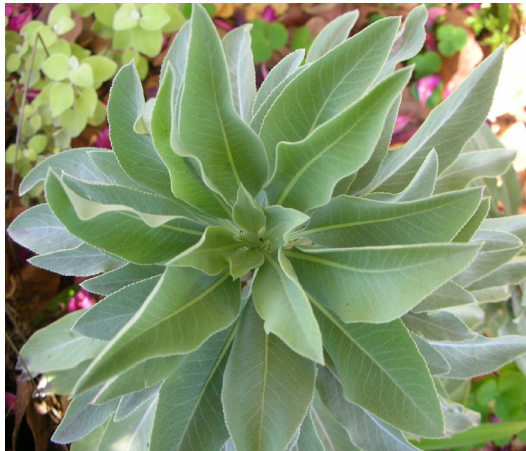
SALVIA APIANA (WHITE SAGE)

Using words and images, identify an example of one of these Native American practices or beliefs related to wellness and healing and connect it to your experience within your own family or community.