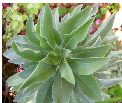
SALVIA APIANA (WHITE SAGE)